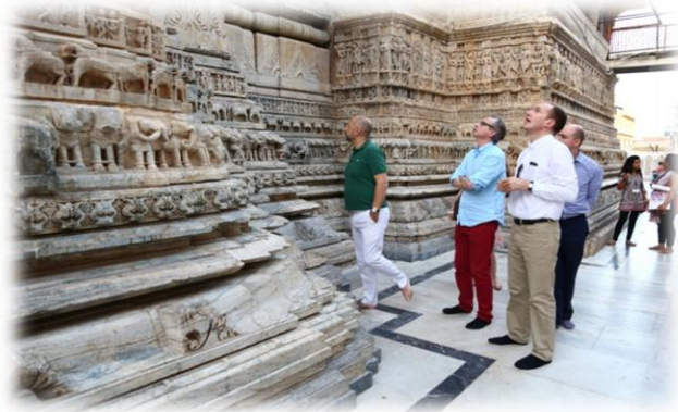
Visit to the temple

Venue: Satkar Banquet Hall, Fateh Prakash Palace Convention Centre