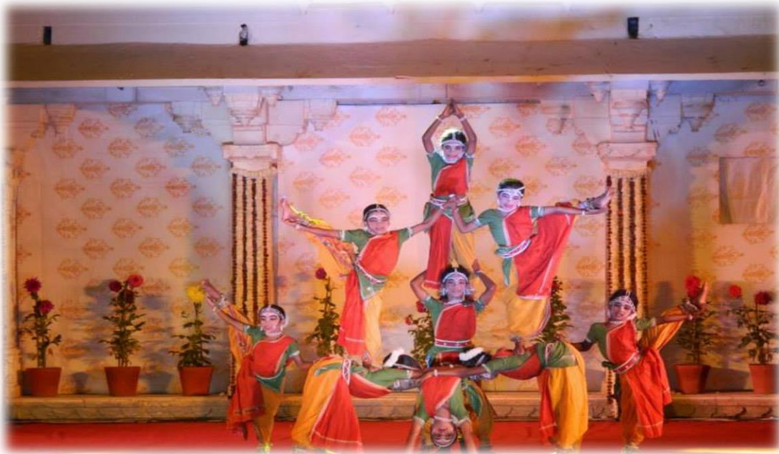
Mesmerizing dance performance during the festival