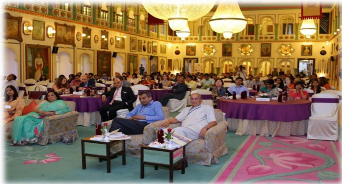
International Conference on Living Heritage